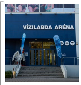
Water Polo Arena

The facility hosts prestigious sporting events and other city events as well.