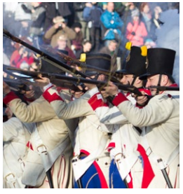
The Battle of Szolnok